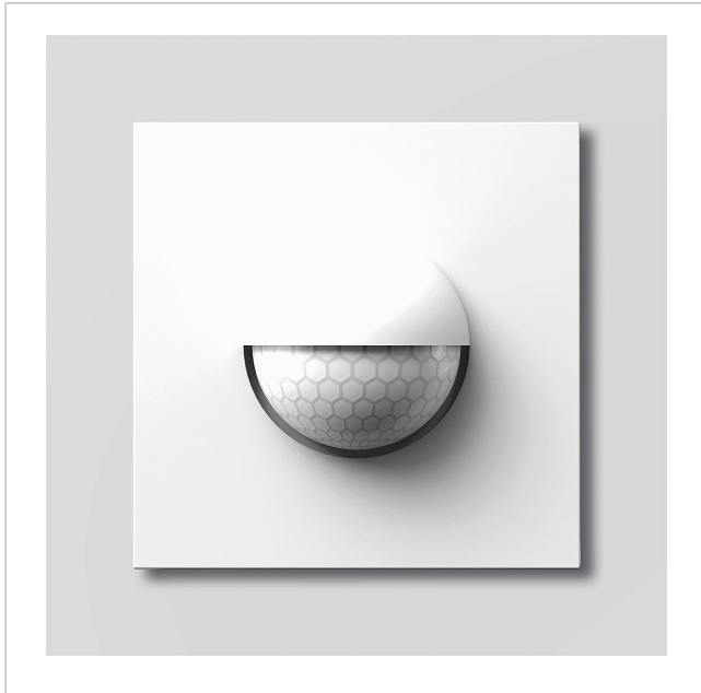
Movement sensor module BMM 611-0